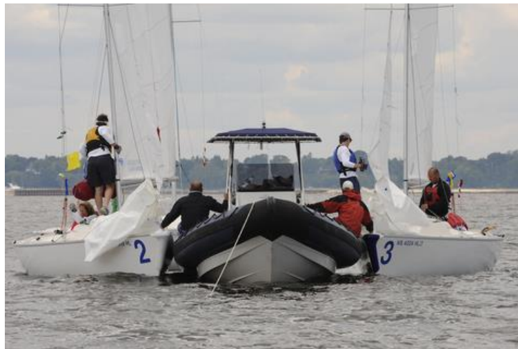
Figure 6: Safety Boat

A 25-foot inflatable RIB Protector will serve as a safety boat.