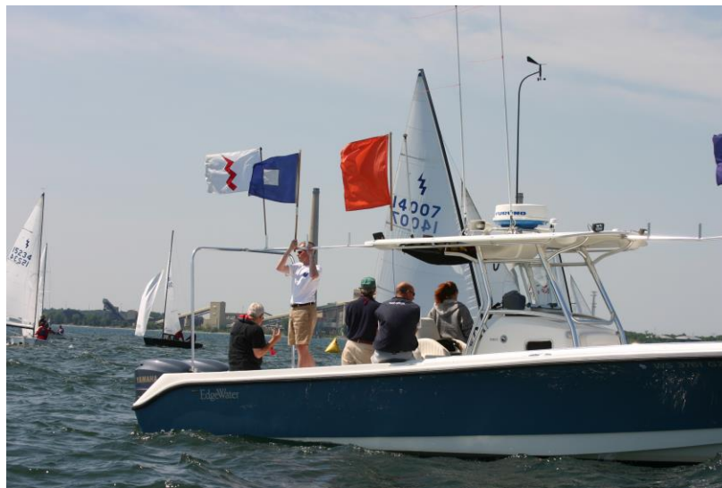
Figure 5: Race Committee Signal Boat

The committee signal boat will be a large 31-foot Edgewater powerboat and the mark set boat will be a 28-foot Edgewater powerboat. Both are in excellent condition, well maintained, and fully equipped with modern marine electronics.