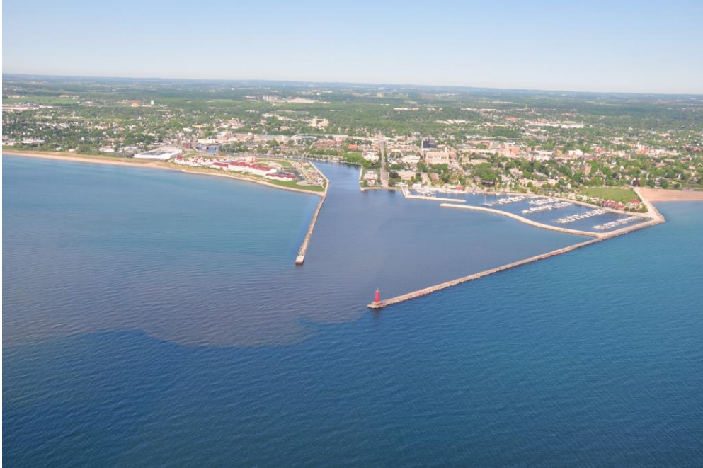
Figure 4: Aerial view of Sheboygan Harbor. Race area is outside the harbor and Sheboygan Municipal Marina within the harbor on the right