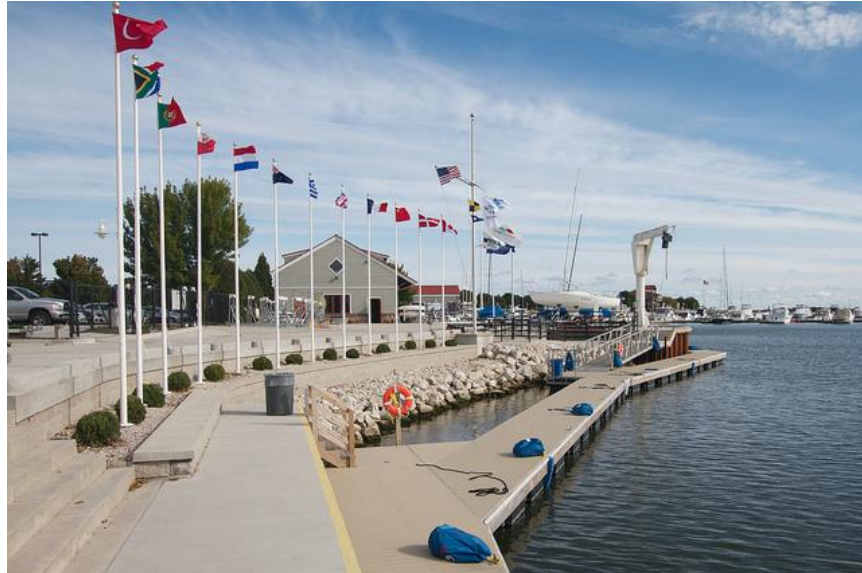
Figure 2: Sail Sheboygan facilities from the south