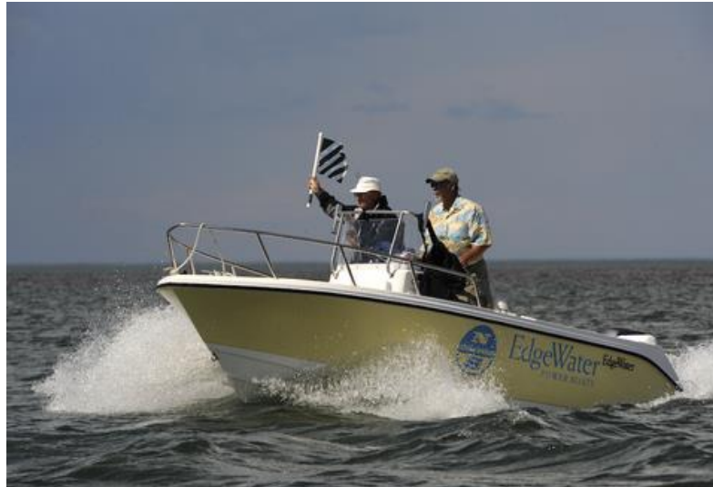
Figure 7: Judge Boat

Sail Sheboygan will be happy to provide boats from our fleet of seven, custom fitted Center Console 17 foot Edgewater Umpire Boats if the judges wish to observe the racing.